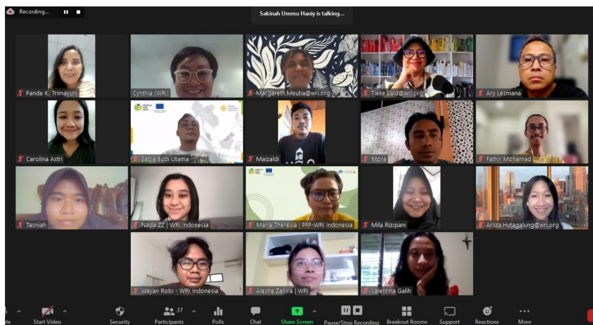
Pic 1: Webinar session on GESI Introduction

Gender, equity, and human-rights issues have been one of the core discussions in the development work. Having a direct implementation on the ground, WRI Indonesia realizes the importance of integrating gender, equity, and human rights component into their projects design, project implementation, and lastly, in WRI research.