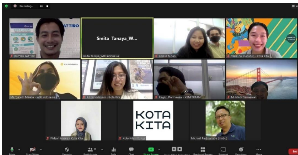
Pic 2: Meeting session with TCI partners for Muda Melangkah initiative